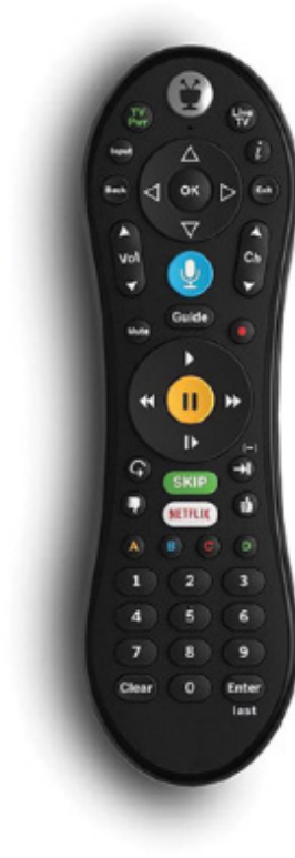
Figure 1.1 The TiVo remote control

In contrast, much effort and thought went into the design of the classic TiVo remote control with the viewer in mind (see Figure 1.1). TiVo is a digital video recorder that was originally developed to enable the viewer to record TV shows. The remote control was designed with large buttons that were clearly labeled and logically arranged, making them easy to locate and use in conjunction with the menu interface that appeared on the TV screen. In terms of its physical form, the remote device was designed to fit into the palm of a hand, having a peanut shape. It also has a playful look and feel about it: Colorful buttons and cartoon icons are used that are distinctive, making it easy to identify them.